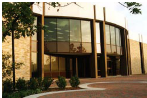
Margaret & Herman Brown Library

The Margaret & Herman Brown Library at Abilene Christian University (ACU) is currently testing Apple Corporation's newest