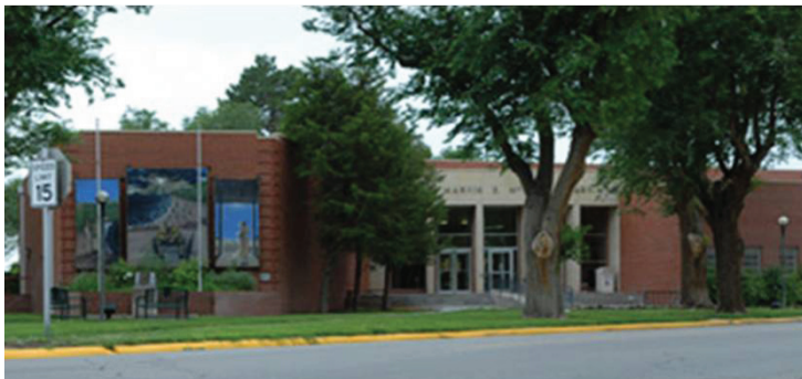
Marvin E. McKee Library

One such Amigos member is Oklahoma Panhandle State University (OPSU). Those familiar with the university, located in Goodwell, know it to be situated in a remote and sparsely populated area of the Sooner State, closer to Colorado, Kansas, New Mexico, and Texas than most of Oklahoma. While only a few miles from the Texas border, Goodwell is nonetheless a considerable distance from the Amigos headquarters in Dallas. That distance, coupled with today’s downsized travel and training budgets, put participation in events such as Amigos conferences well out of reach. Much-needed training for staff at the Marvin E. McKee Library was adversely impacted as well.