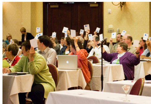
Voting representatives cast ballots.

Amigos Members resoundingly approved adoption of a new membership structure and fees schedule at the May 7, 2009, Amigos Member Business Meeting in Dallas. The new membership structure